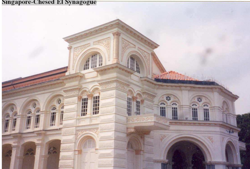
Singapore-Chesed El Synagogue

The Synagogue is orthodox, and was completed in 1905, and was designed in Palladian style. It has a seating capacity of 370; although the morning we attended there were approximately 30 men. Most of the men wore “ Tfillin ” we were asked to lay tfillin, but politely refused. Figure (2)