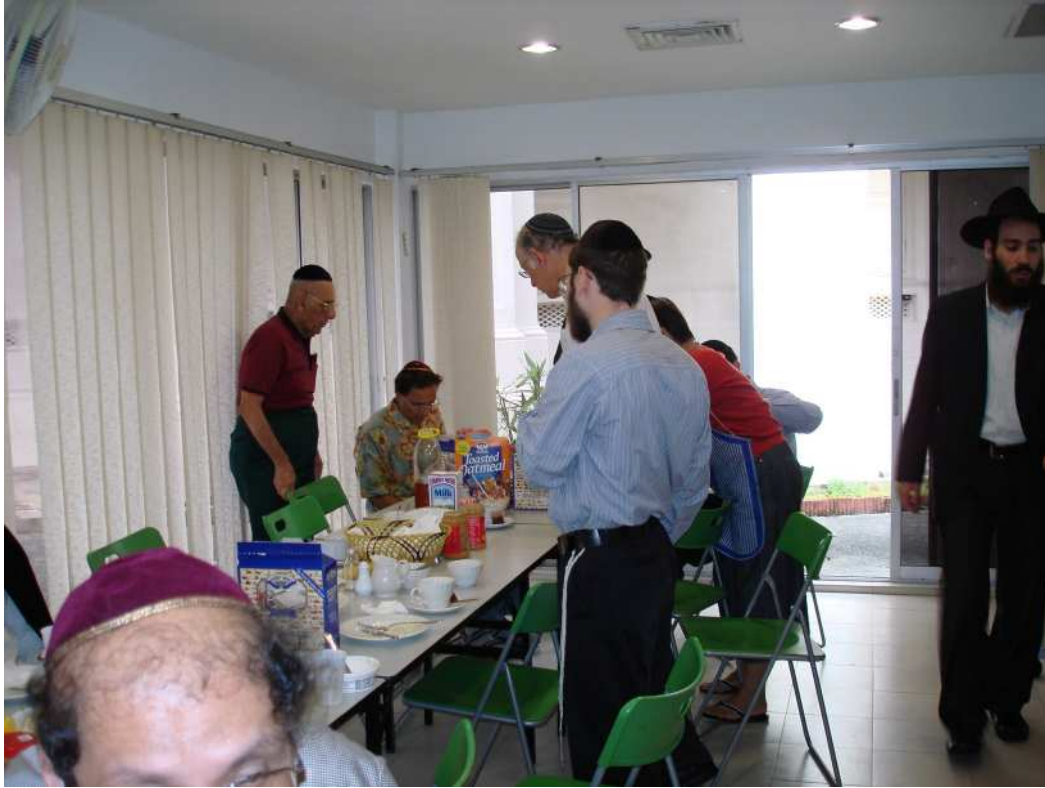
Breakfast immediately following services. The pancakes were the best!