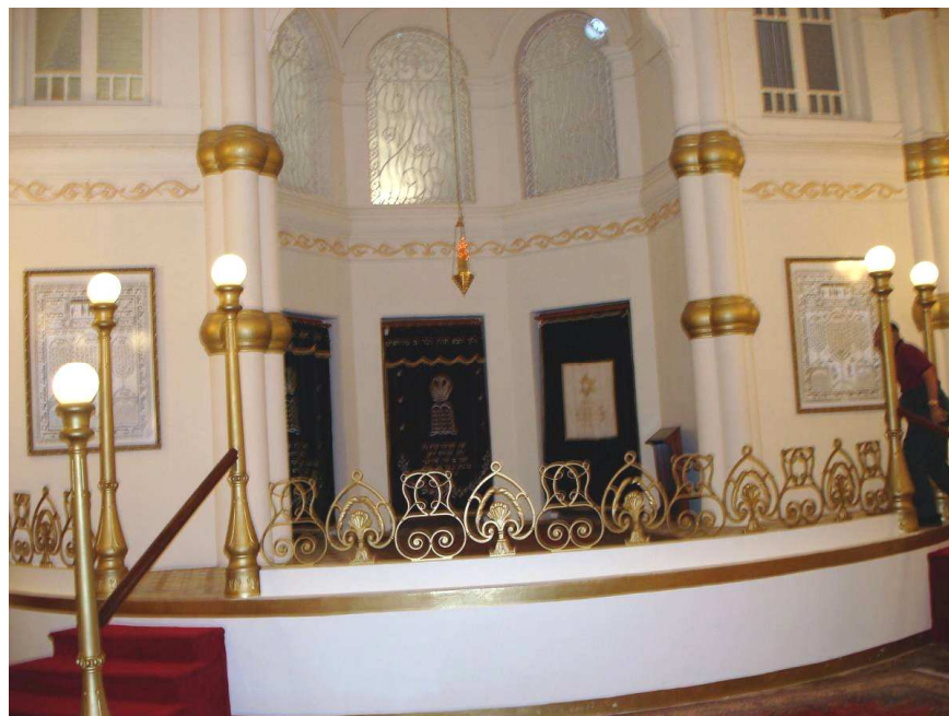
Front view of the Chesed El synagogue